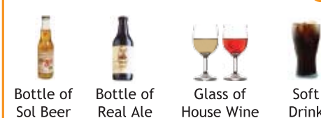
Bottle of Sol Beer Bottle of Real Ale Glass of House Wine Soft Drink