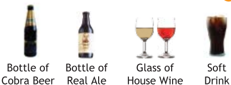
Bottle of Cobra Beer Bottle of Real Ale Glass of House Wine Soft Drink